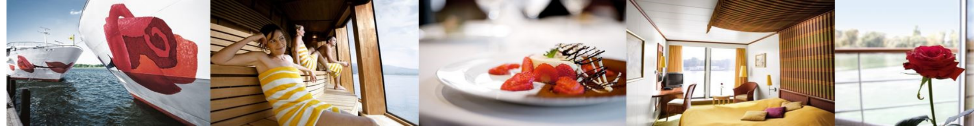
*No Single Cabin Supplement