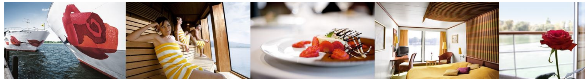
*No single cabin supplement